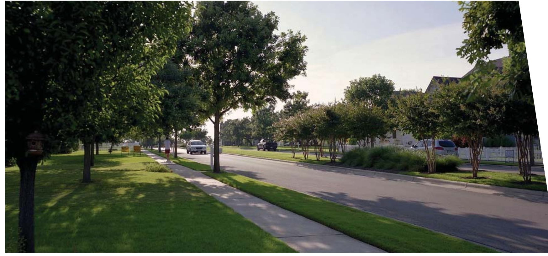
Sidewalks structured to facilitate movement