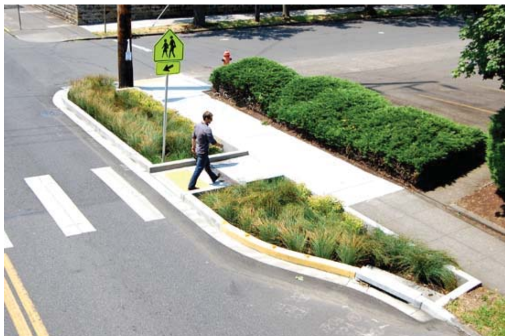
Crosswalks providing safety