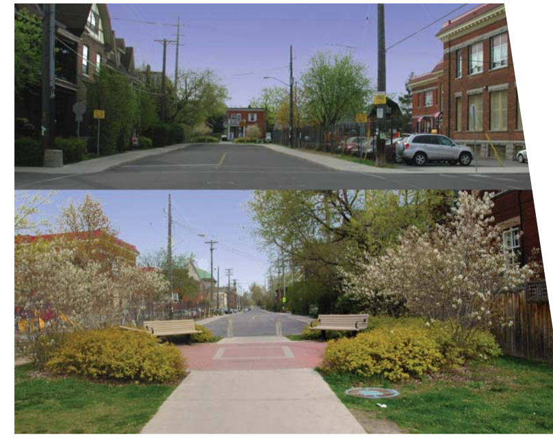
Transformed green space