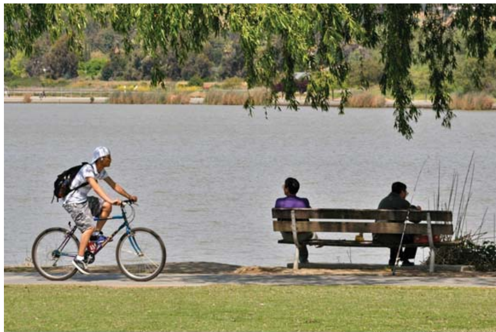
Sidewalks and bike paths for recreation