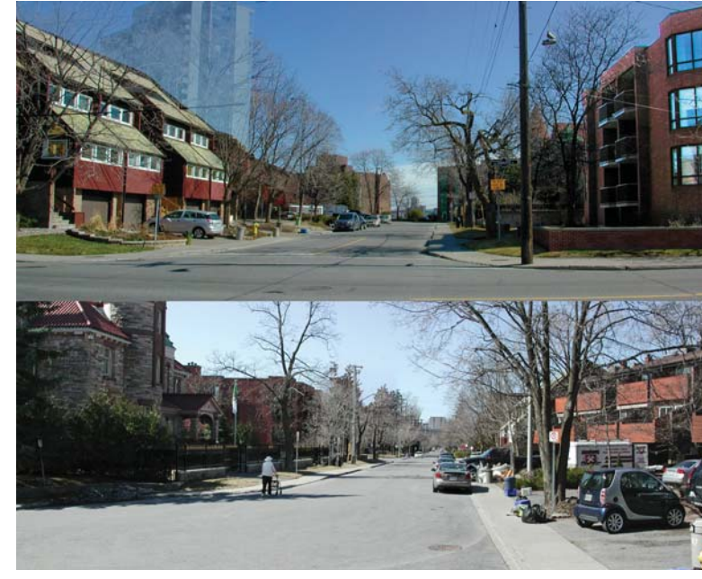
Residential smart growth