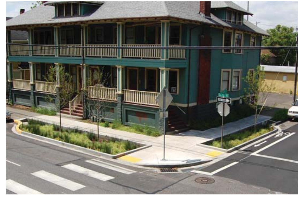
Crosswalks providing safety