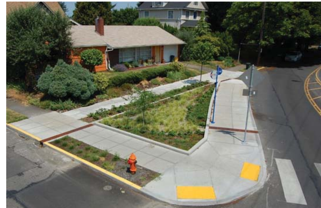
Crosswalks providing safety