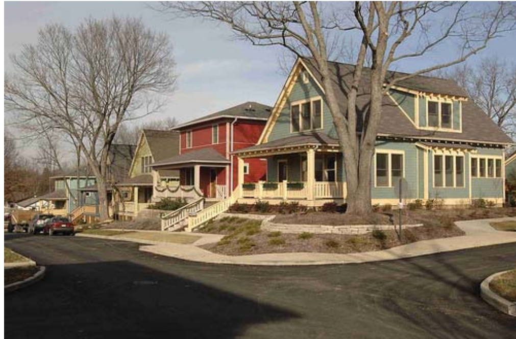
Sidewalks inviting walkability